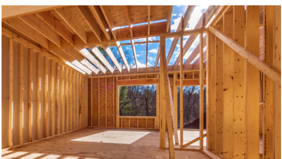
Due to their flexibility, battery-powered circular saws are being used more and more in the carpentry trade as well as in interior construction.

Battery-powered circular saws are becoming increasingly popular. To achieve the longest possible battery lifetimes, circular sawblades that consume less energy than corded machines are particularly in demand. However, this is often at the expense of cutting quality.